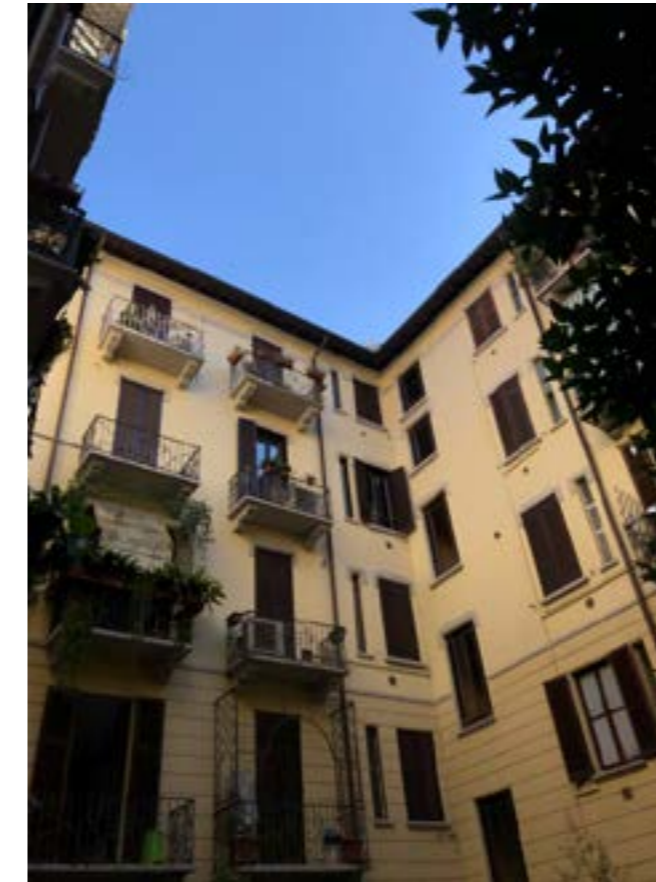
My beautiful view from my apartment

During classes I quickly discovered cultural differences. IED is known for being an international design school, but they are not very openminded to other cultures, despite their own. I have had a lot of uncomfortable experiences as a student at IED and I have been on the verge of collapsing mentally in multiple situations, because I haven't been able to express myself openly. I even tried to contact the coordinators of the school in order to explain how I felt, but they neglected me and my feelings. This was very uncomfortable, because it made me feel totally exposed and alone. In Denmark I'm usually able to use my freedom of speech, but at IED I quickly discovered that you're not allowed to discuss any personal or professional issues about the courses or the teachers. The teachers are always right and if you disagree, you'll end up in trouble. An Italian co-student even told me that it's better to keep your mouth shut, otherwise you'll end up with troubles or you'll even receive a bad grade for the exams. Other than that I have had approximately 8 individual exams, which has been super intense and much more demanding than what I'm used to in Copenhagen. Luckily I managed to do well with the exams, even though this required all my time - and no sleep for almost three weeks.