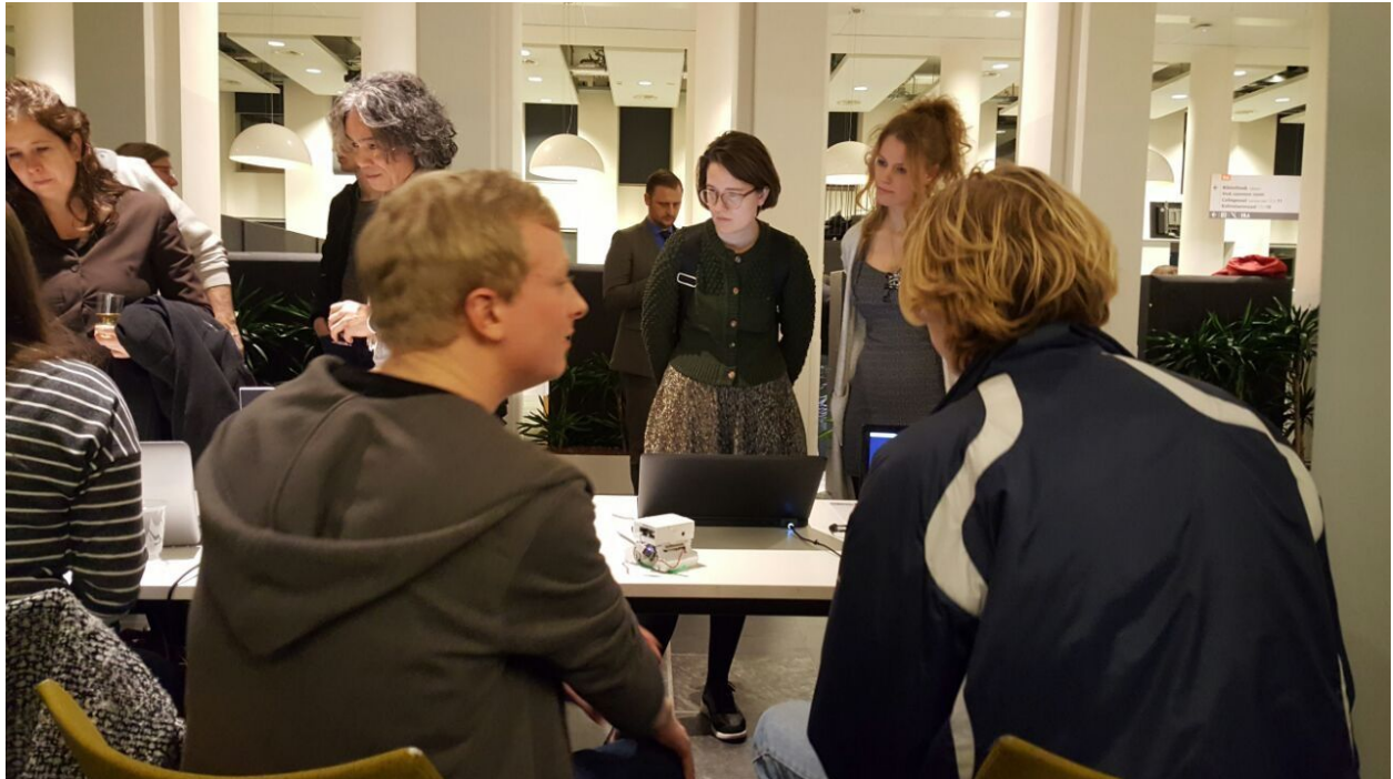
Product presentation in January

I went to Amsterdam from September 2016 to end of January 2017. At KEA I was enrolled in Software development. In holland I took a minor in Internet of Things, as suggested by the KEA exchange coordinator. Hva was very helpful in sending me all the information I needed to have before starting. They even organised an intro week for exchange students to meet each other and show them the facilities.