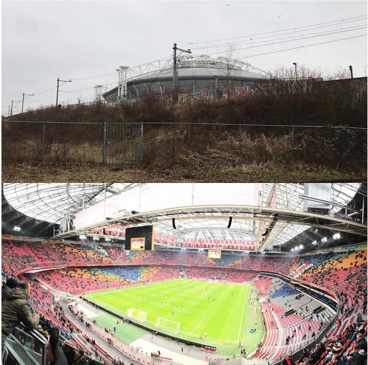
Amsterdam Arena, a temple for who loves football

If you like playing football try to join a club at WV down south close to the Science Park metro station, they have many fields and over 40 teams Two training per week and a sunday game. Otherwise Hva offers gym facilities for small money.