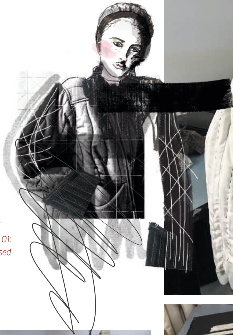
Some pictures of my work for unit 01: Industry Specialised Project.