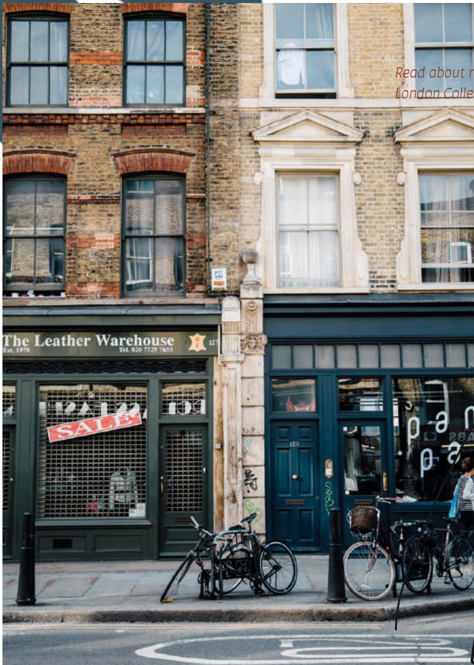
Picture from Shoreditch.

Read about my exchange semester at London College of Fashion, London UK.