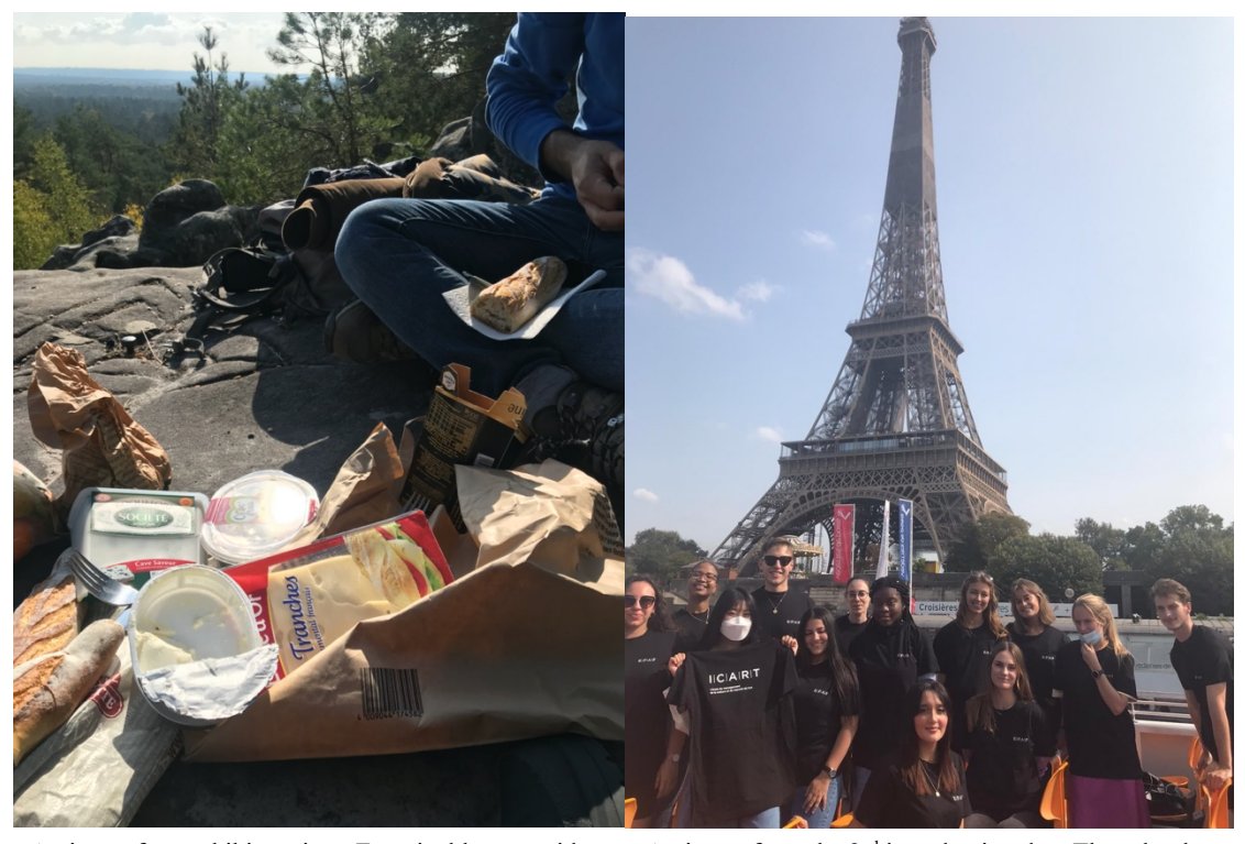
A picture from a hiking trip to Fontainebleau outside of Paris with my roommate.

My very last, but biggest advice would be to go on an exchange, it's an experience you won't get anywhere else.