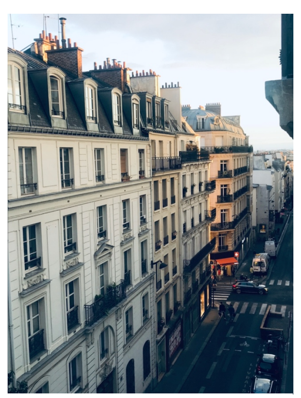
{\it View from \ my \ 1st \ accommodation \ in \ Montmartre}