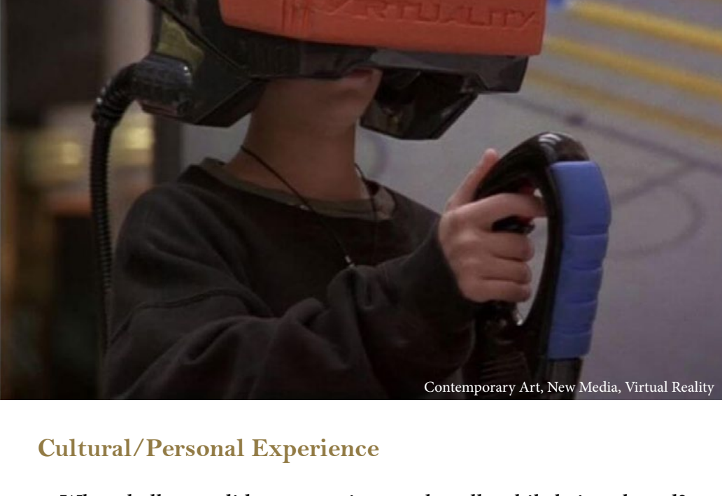
Contemporary Art, New Media, Virtual Reality

I studied at IED during the Corona-Crisis and was given in advanced. However, I did not choose not to have Coding/Web Design as it was on an advanced level. As mentioned, its important to have the 5 extra ECTS points in order to be flexible once you arrive!