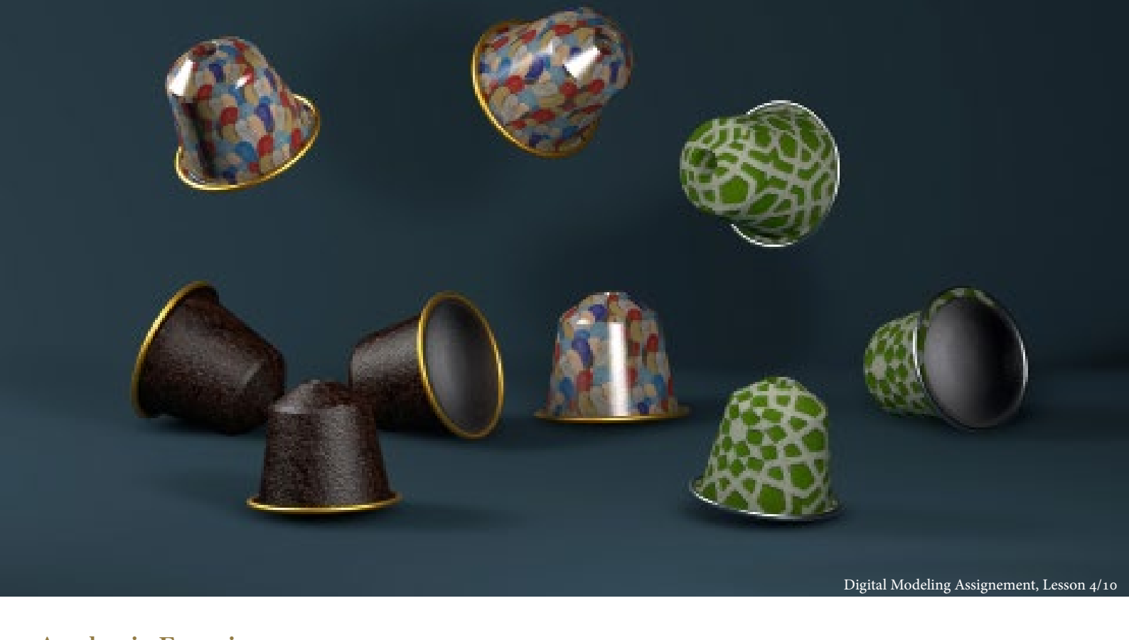
Digital Modeling Assignment, Lesson 4/10

We learned the basics and advanced Adobe After Effects properties. The teaching consisted of a lectured "tutorial" in class with weekly fun assignments based on one's abilities and commitment. For the exam, we had to make an advanced 30 second to 1 minute long intro-theme to a self-selected movie with the techniques we learned.