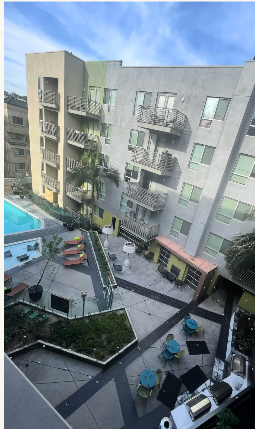
AVA Little Tokyo, Downtown