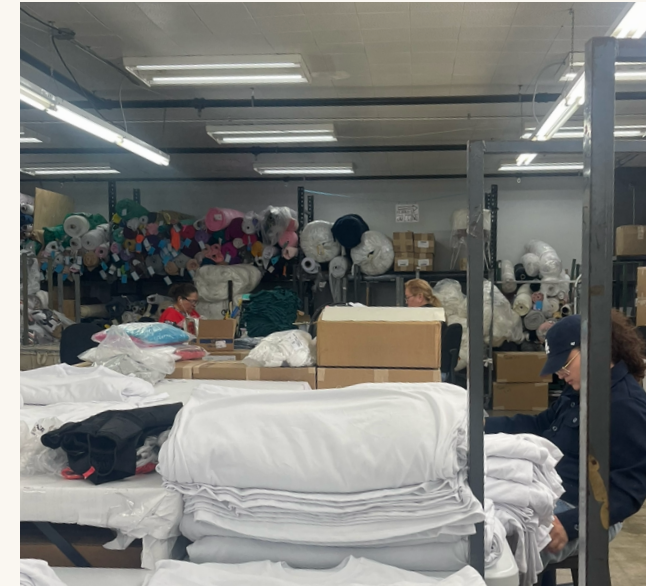
Production & Sourcing Strategies

I found all of my classes to be beneficial. The instructors were knowledgeable and had extensive experience in the fashion industry.