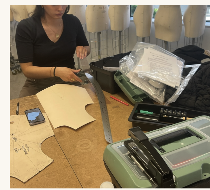
Apparel Process I