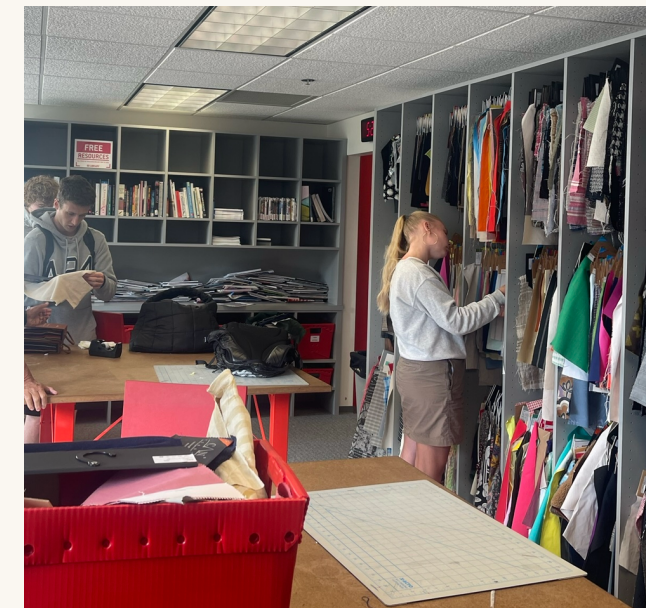
Production Control & Planning