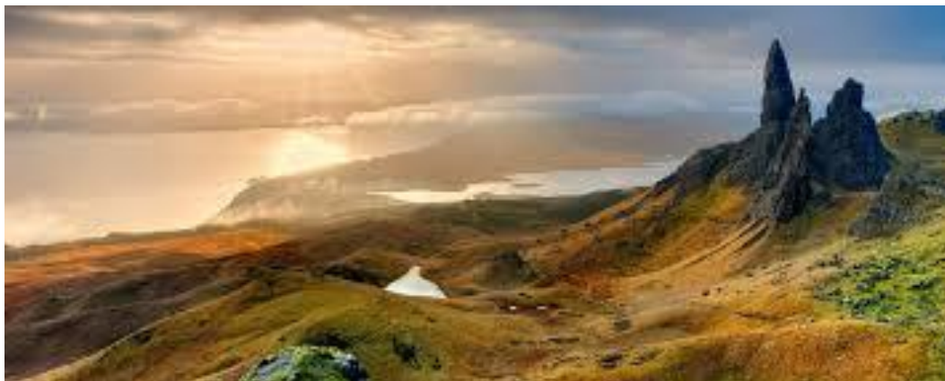
Isle of Skye

alcohol or look a little drunk you will be thrown out or denied buying alcohol. I lived in an apartment shared with two other boys. A little expensive, but you can get fairly good prices (don't get housing from the dorms they are crazy expensive). I spent a lot of time in the gym and having a good time with my roommates. I mainly made my own food (food is a lot cheaper than in Denmark, and so is shopping in general). Edinburgh is an extremely beautiful city with loads of beautiful buildings and sights like this little dog. I was so lucky that I got time to go to the highlands, which by far was the highlight of my trip.