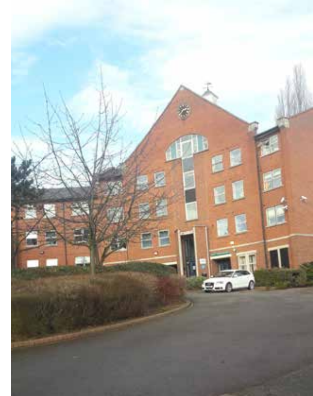
Blenheim Halls my accomodation