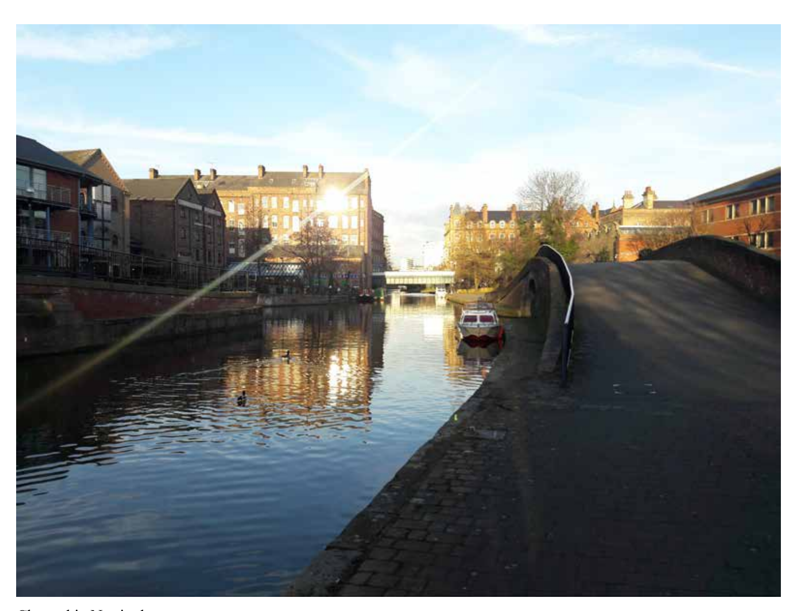
Channel in Nottingham