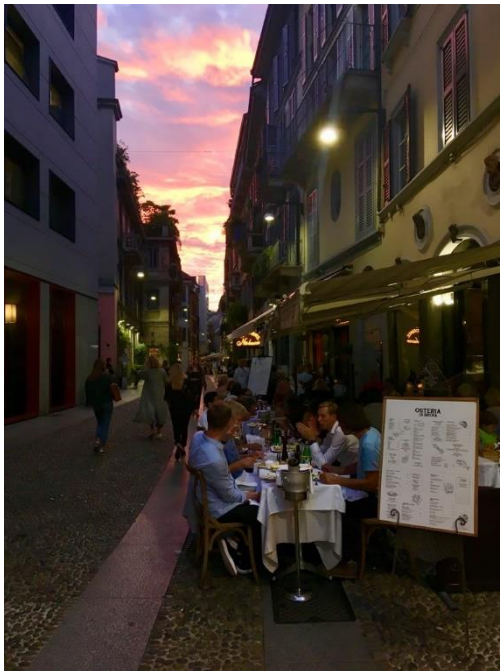
Aperitivo in Brera September, 2019.