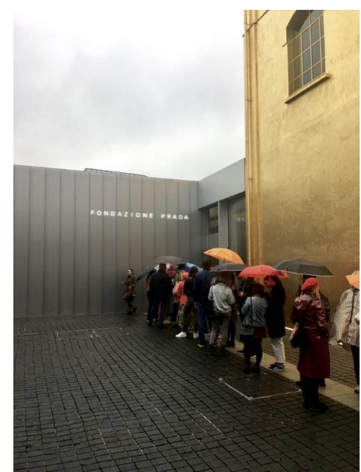
Fondazione Prada for cultural events and art exhibitions November, 2019.