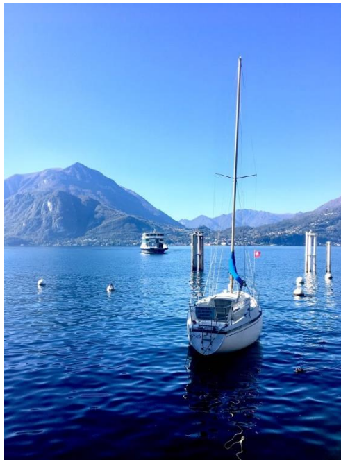
Views on Lake Como October, 2019.