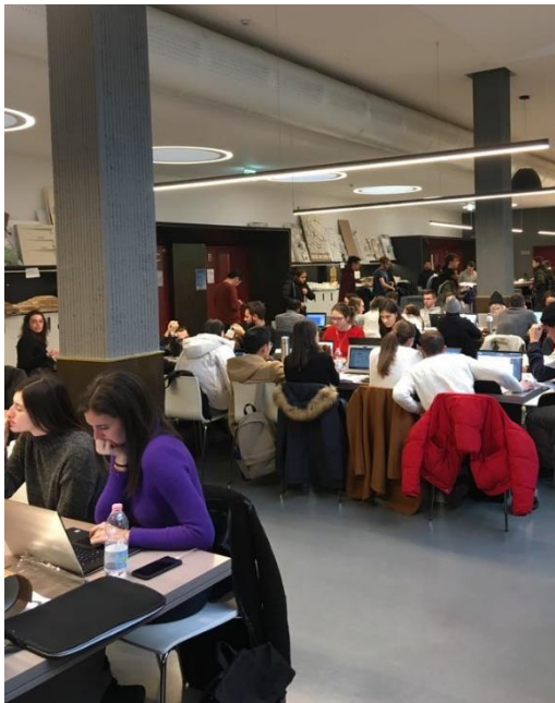
Popular study space Agora is often overcrowded December, 2019.

quite hard to do a group meeting since there is no group workspace provided anywhere in or near campus Leonardo. Cafes and restaurants around the campus have limiting laptop usage time or they do not allow them at all. Usually, you are lucky if you find a place to sit and study in study spaces or library of Leonardo campus. Furthermore, WiFi in the study spaces of the university is slow or unavailable and most of the plugs are not working. There are many study spaces in the open air around the campus Leonardo and students are using them during the winter due to the lack of interior space. Classrooms are quite laptop-unfriendly since the plugs are embedded in the walls and there are no extension cables provided. University canteen is completely full during the lunch break which makes the most students bring their own lunch boxes, buy food in the nearby supermarkets or grab something small on the go. We would all usually eat over our working tables in the classrooms or library (which has led to an interesting combination of smells). I have found study environment overall uncomfortable. On the positive note, the renovation of the interior gardens in the campus Leonardo was beautifully done and during the warm times (which in Italy is until the beginning of November) the green spaces around the campus were vibrant and pleasant.