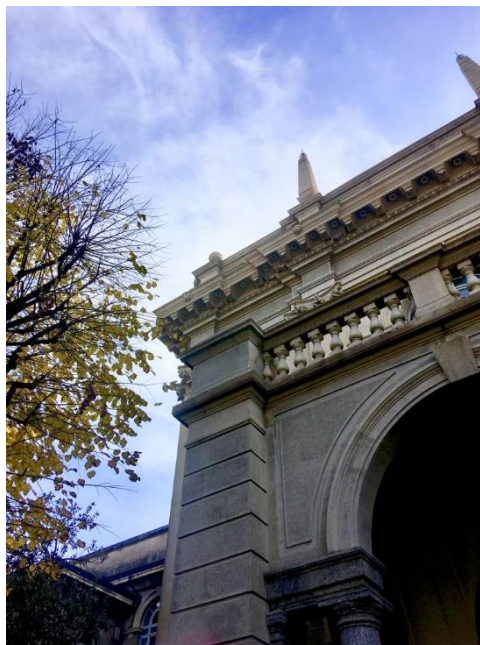
Historic buildings of campus Leonardo are still in function November, 2019.