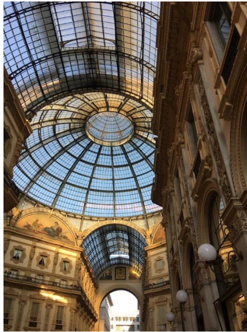
Galleria Vittorio Emanuele II September, 2019.