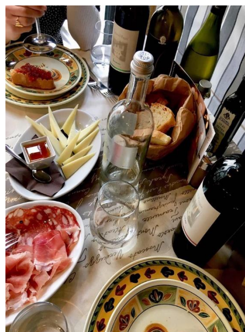
Italian cuisine November, 2019.