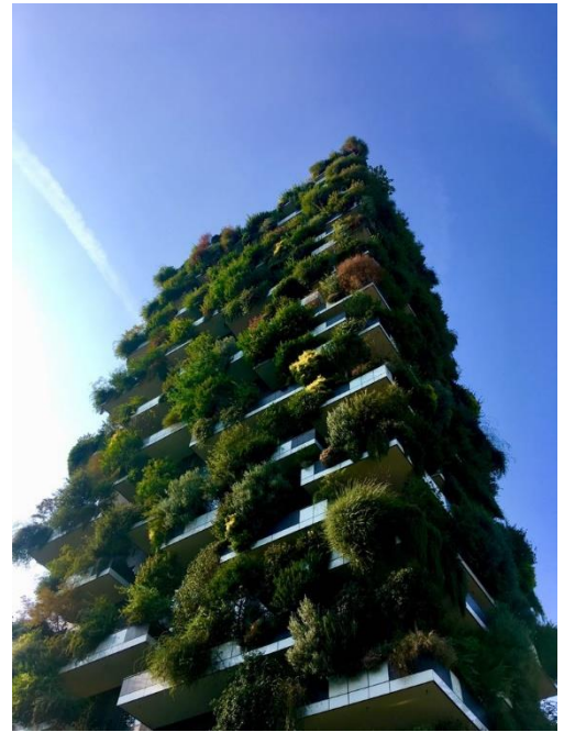
Bosco Verticale as the greatest example of the contemporary architecture in Milan September, 2019.