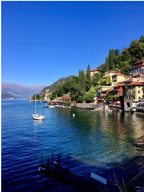
Varenna October, 2019.