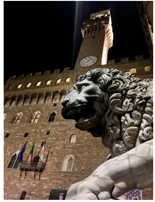
Florence November, 2019.