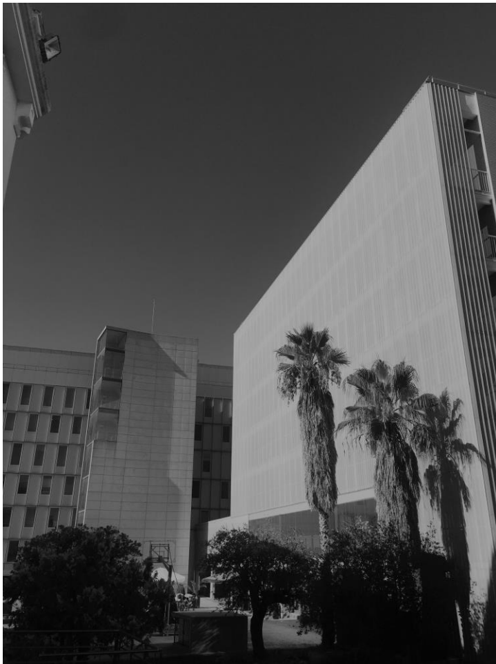
La Salle Campus

The university building is close to Barcelona mountains and Tibidabo. Very nice area. The campus has design studio on the last floor and a big canteen in a different building. It is the typical life on campus type of school.