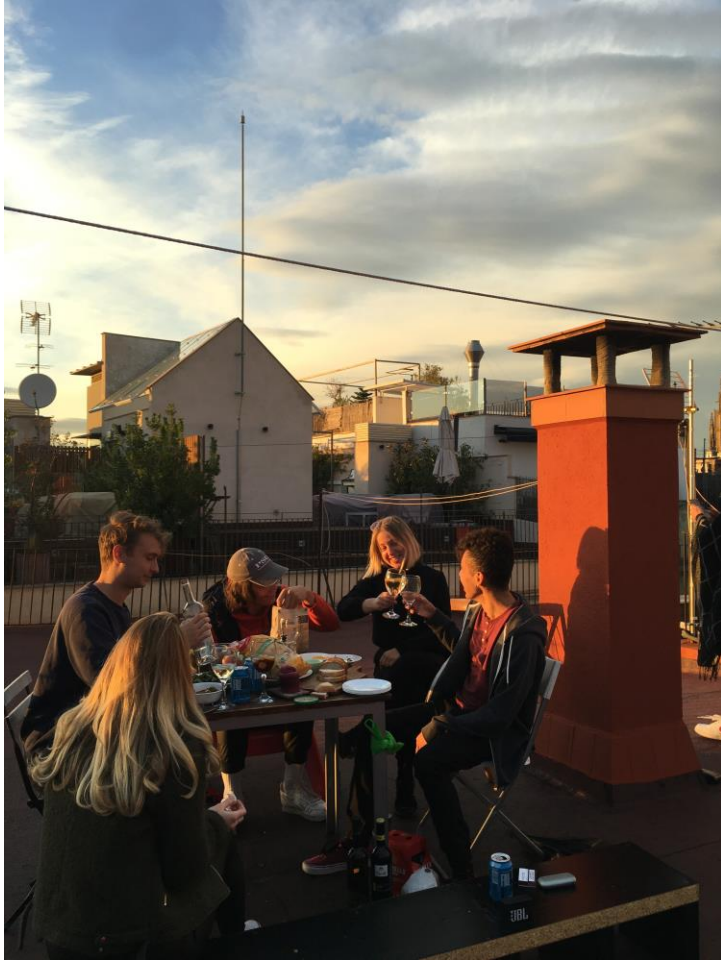
Sunsets at the rooftop