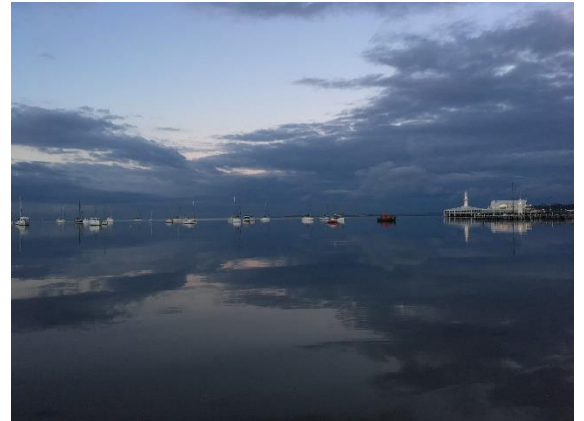
6. The waterfront and the pier