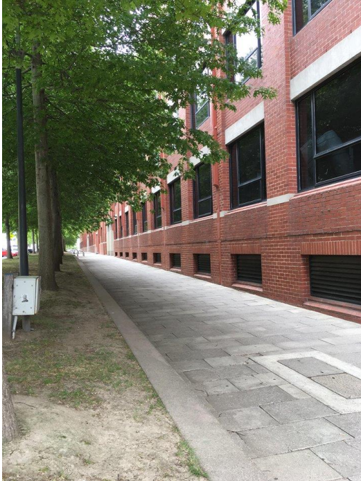
3. Deakin University

The campus is just 5 minutes' walk from the Waterfront Residence. The school has good facilities: Printers, computer labs, cafés, library, bookstore, architectural studio and a medical center. It is a nice place to study, with nice rooms and lecture halls.