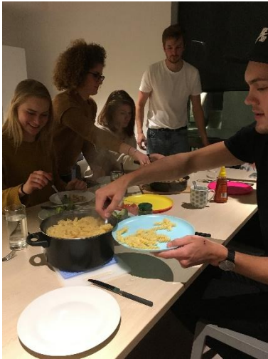
4. Dinner at the residence