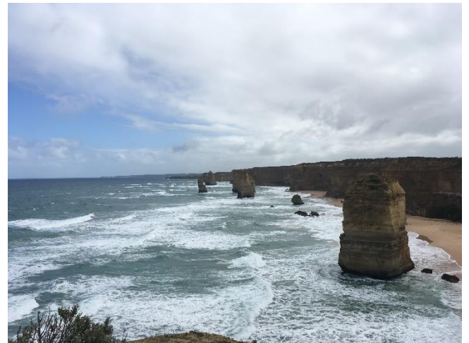
8. The twelve apostles on the Great Ocean Road