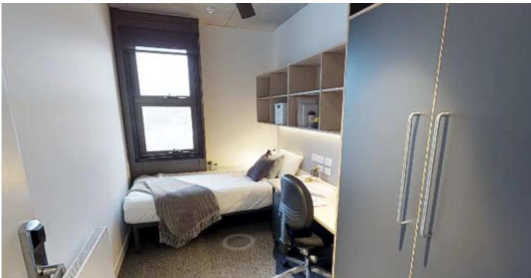
1. Picture of a bedroom at the Waterfront Residence. See more pictures at: http://www.deakin.edu.au/life-atdeakin/accommodation/on-campus/geelong-waterfront-campus-accommodation

The residence is an expensive accommodation, but I really enjoyed it. It is only for 4 months, and a lot of your classmates and other students are staying there as well. It is nice to live so close with others, you always have somebody close by, but you also have your own room to relax in. Even though it is kind of expensive they also plan activities you can join, such as: A Great Ocean Road overnight trip, Bubble Soccer, dinners, bowling, yoga etc. So, I would definitely recommend a stay at the Waterfront residence.