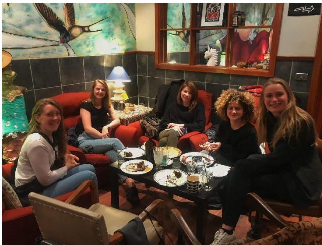
7. Cake date with the other exchange girls