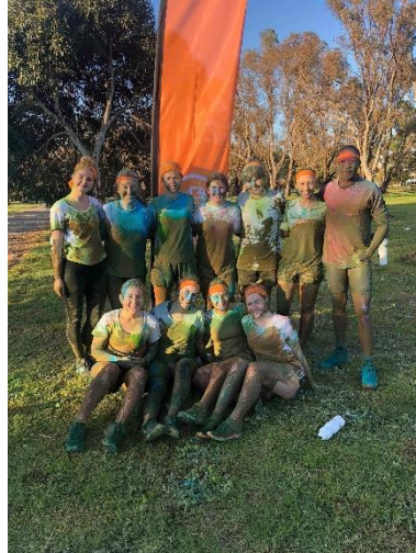
5. Color run, organized by the Waterfront Residence