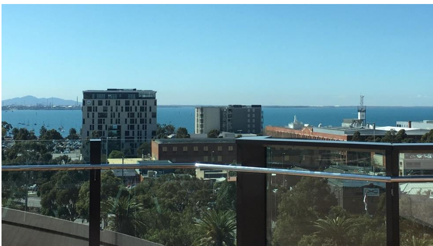
2. The big white building is the Waterfront Residence and the red building to the right is the University. Both with a view over the water.

Deakin University has four campuses in and around Melbourne, when studying architecture and construction management, you will be at the Geelong Waterfront Campus. Geelong is a suburb about one hour from Melbourne center. Geelong is a very nice city with everything you will need and a beach. I very much enjoyed living there, it is a beautiful calm place, and it is easy to do a weekend trip to Melbourne with the train.