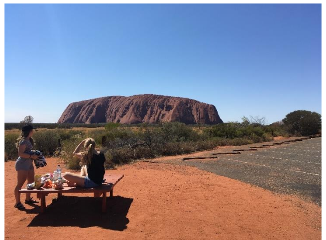
10. After exams I started my travels with a trip in a campervan to the Red Center and Uluru - It is beautiful!